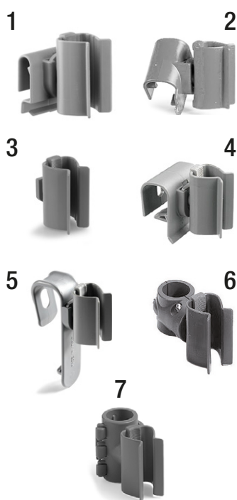
Plastic handle holder