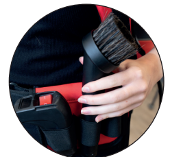
Waistbelt tool storage