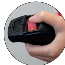
Integrated hand control