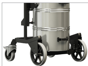
OPTIM TROLLEY IS EXTREMELY DURABLE AND MANEUVERABLE