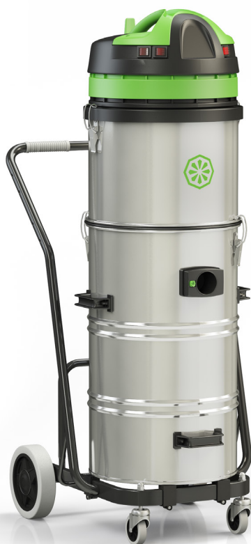
GS 3/78 CYC