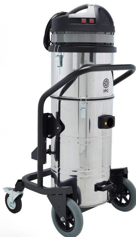
GS 3/78 OPT CYC