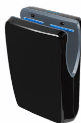
AA24650 8427950360619 Black finish