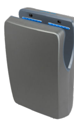
AA24950 8427950360626 Graphite finish