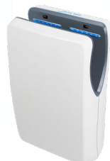
AA24050 8427950360596 White finish