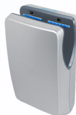
AA24550 8427950360602 Silver finish